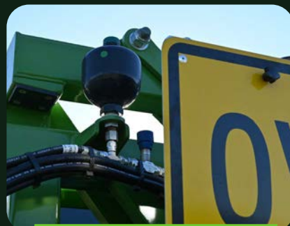
BOOM SUSPENSION ACCUMULATORS