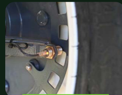
WHEEL SPEED SENSORS