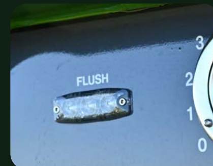
ELECTRIC FLUSH CYCLE