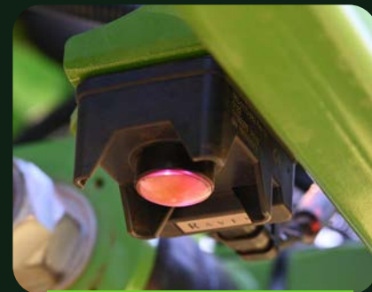
AUTOMATIC HEIGHT CONTROL