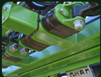
BOOM YAW DAMPENING