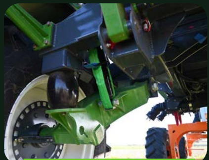
HIGH CLEARANCE SUSPENSION